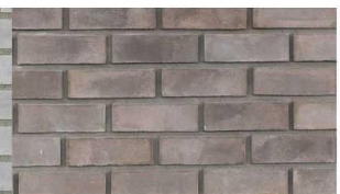
Selkirk - Contemporary Brick Brownstone