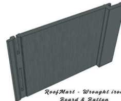
RoofMart - Wrought iron Board & Battan