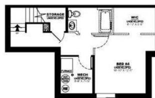
LOWER FLOOR PLAN = 474 SQ FT