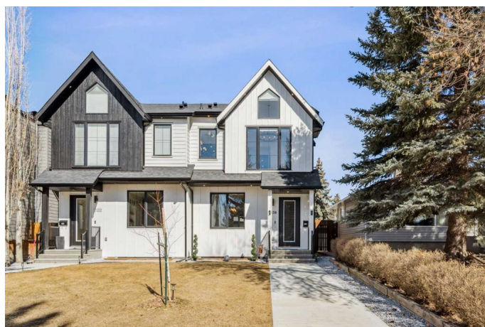
2130 53 Ave SW, Calgary, AB

Main Floor Exterior Area 949.36 sq ft Interior Area 678.23 sq ft