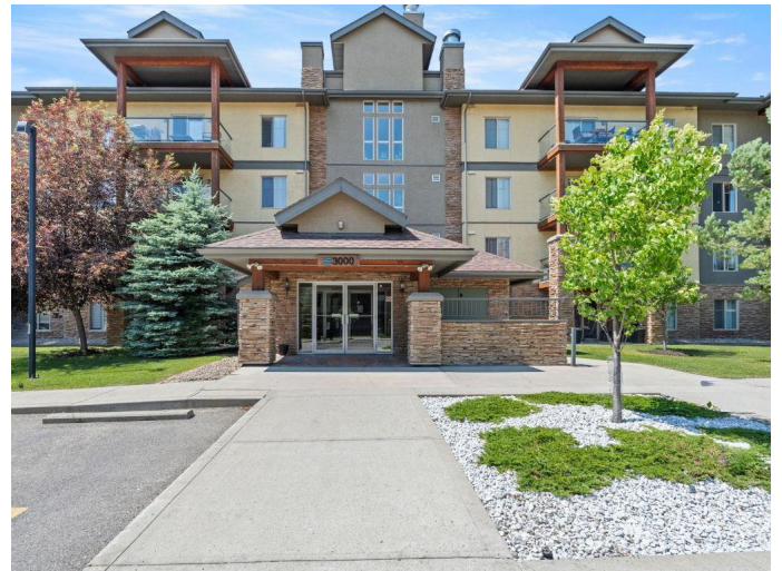
3113-92 Crystal Shores Rd, Okotoks, AB