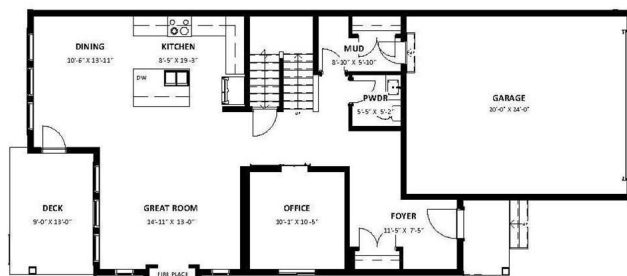
MAIN 1,085 SQ.FT. GARAGE 477 SQ. FT.