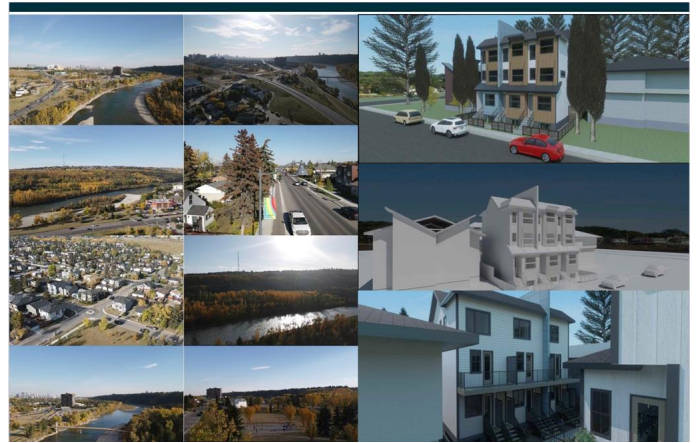
THE PLOT OF LAND : VISUALIZING YOUR NEXT PROJECT HERE

Seize this remarkable chance to acquire a prime MU-1 50 X 120 lot and bring your vision to life with the construction of the following Mixed-use building- a multi-story structure with commercial spaces on the ground floor and residential units above, creating a lively street atmosphere while addressing housing needs. Consider developing a series of townhouses or row houses, offering affordable options for families and individuals in a mixed-use setting. Live-work units- Design innovative spaces that blend residential living with commercial functions, perfect for professionals looking to operate a business from home. Small Retail or Office Space- Construct a boutique retail or office space to support local businesses, cafÃ©s, or professional services, enhancing the community's economic landscape. Explore the possibility of creating facilities for community services, such as a daycare, community center, or health service center, that would greatly benefit local residents. Montgomery is a thriving neighborhood with an array of amenities just a short walk away, including shopping at Market Mall, a diverse selection of restaurants, and the scenic Bowness Park along the Bow River. Additionally, youâ€™ll have quick accessâ€”whether by transit or vehicleâ€”to the majestic Rocky Mountains, Canada Olympic Park, Winsport, the University of Calgary, and both the Childrenâ€™s and Foothills Hospitals. The area is experiencing a surge of new families and positive growth.