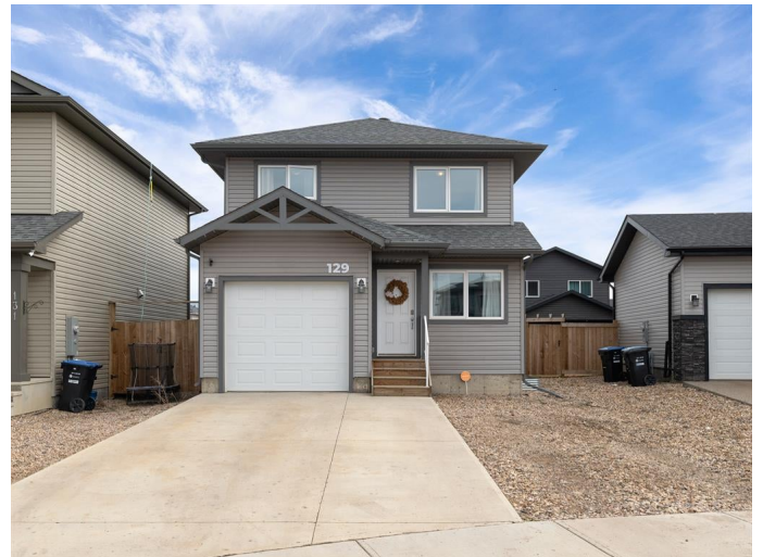
129 Airmont Ct, Fort McMurray, AB