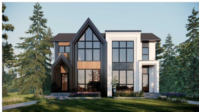
1917 21 Avenue NW (Unit 1)

Welcome to this stunning residence effortlessly combining modern architecture and thoughtful design in the heart of Banff Trail, built by the award-winning ACE HOMES. The home boasts desirable SOUTH REAR EXPOSURE complemented by large windows inviting warmth and light into every corner. Over 2600 SQFT of developed space, provide ample comfort and functionality. This home comes equipped with a 2 BEDROOM LEGAL SUITE, with side entrance & laundry facilities there is great potential as a mortgage helper. The main level unfolds with a generous sized dining room complimented by ample lighting from oversized windows. The kitchen is uniquely placed at the centre of the home with stainless steel appliances and high rise custom cabinets, bar seating & expansive built-in pantry. The addition of a MAIN FLOOR OFFICE enhances productivity & organization. Adding to the convenience of the main floor is a half bathroom & mudroom, with custom built-in storage and bench. Upstairs the expansive primary suite welcomes you with sky high VAULTED CEILING creating the ultimate luxurious retreat. The primary suite includes walk-in closet and outstanding 5-piece ensuite complete with free standing soaker tub and walk-in rain shower. Two secondary bedrooms include tray ceiling detailing adding a lux touch. Laundry room with sink and & a linen closet enhance practicality and storage on this level. The legal basement suite makes an impression with